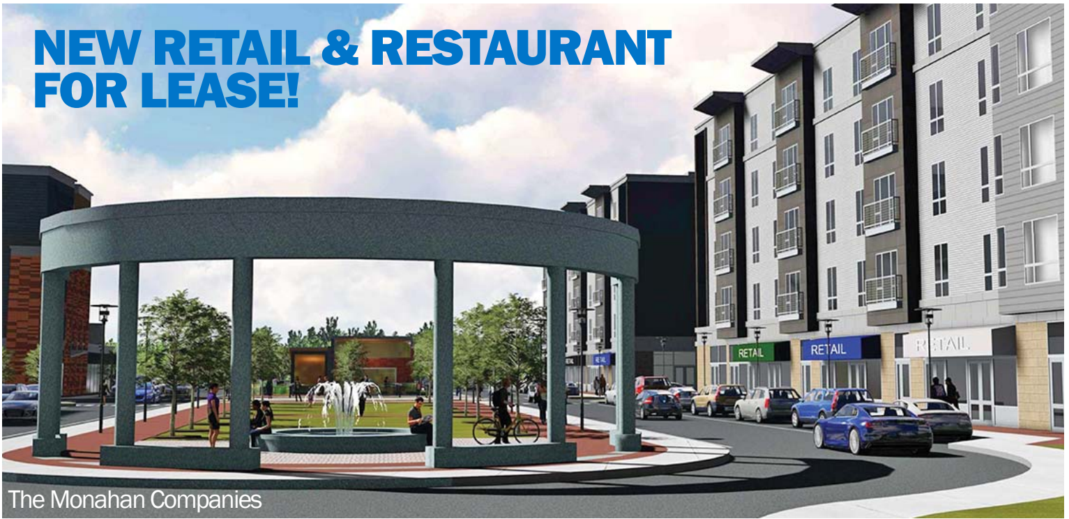
The Monahan Companies